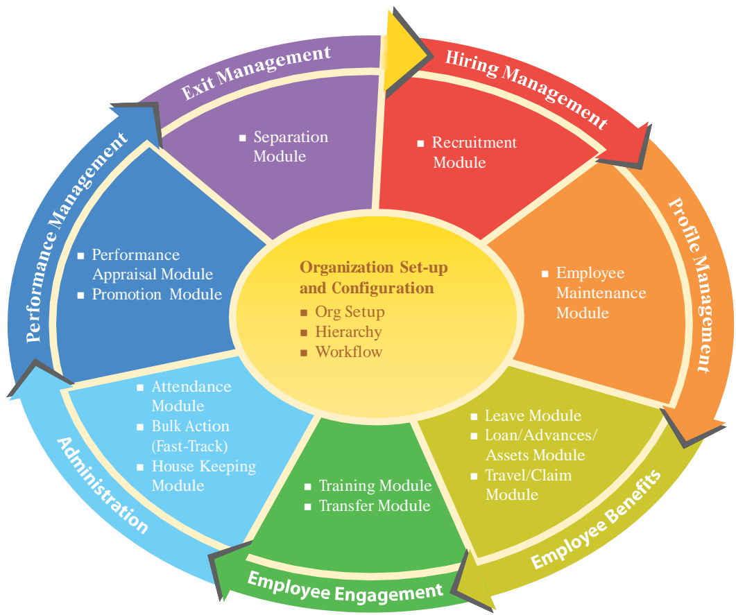
An overview of the iON Human Resources Management Solution (HRMS)